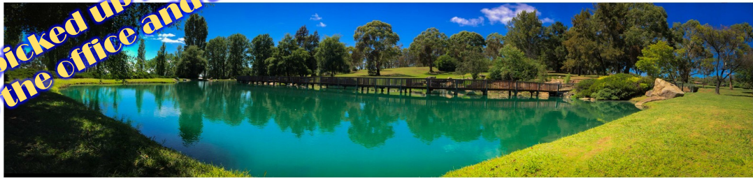
Armidale Arboretum - Photography Group

Have you picked up your 2025 Calendar yet? $10.00 each Call in to the office and get one. Mon - Wed 9:30 to 12:00