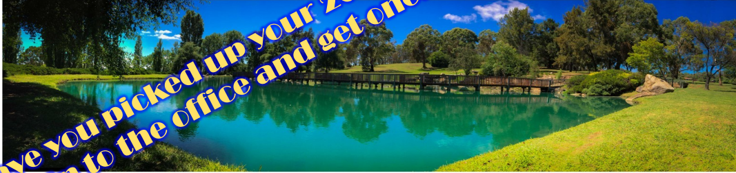
Armidale Arboretum – Photography Group

Have you picked up your 2025 Calendar yet? $10.00 each Call in to the office and get one. Mon - Wed 9:30 to 12:00